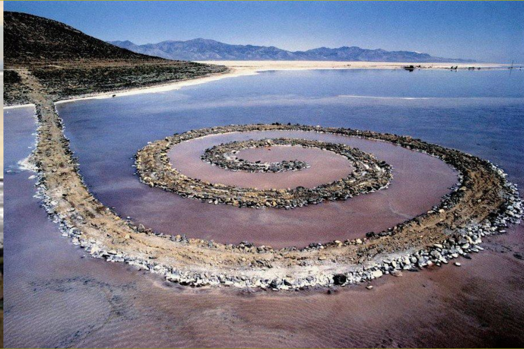
Robert Smithson - "Spiral Jetty"